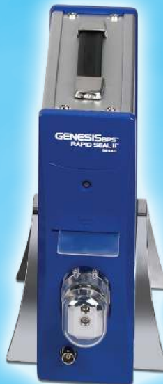
RAPID SEAL II™ SE540 SPACE SAVING BENCHTOP SEALER