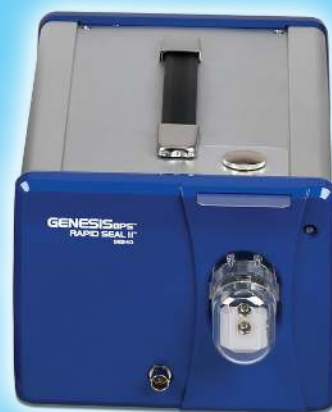
RAPID SEAL II™ SE330 & SE340 STANDARD BENCHTOP UNIT

Component processing is too important to leave to chance.