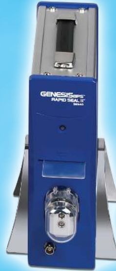
RAPID SEAL II™ SE540 SPACE SAVING BENCHTOP SEALER