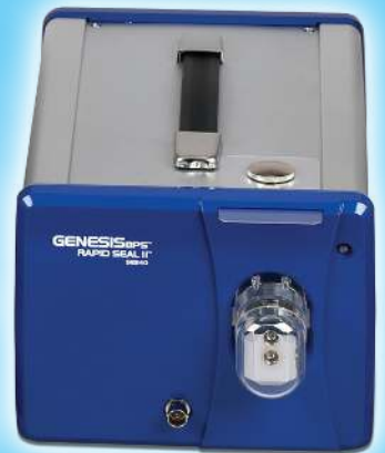
RAPID SEAL II™ SE330 & SE340 STANDARD BENCHTOP UNIT

Component processing is too important to leave to chance.