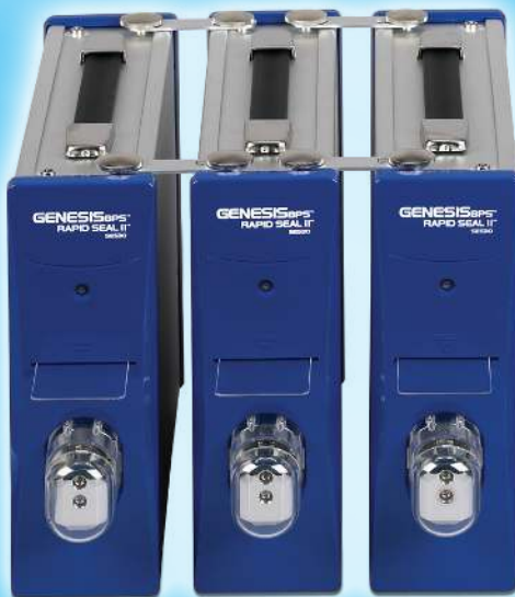
RAPID SEAL II™ SE530 MULTI-HEAD SEALER