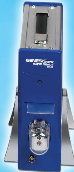
RAPID SEAL II™ SE540 SPACE SAVING BENCHTOP SEALER