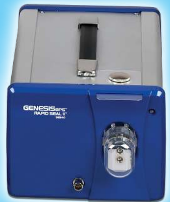
RAPID SEAL II™ SE330 & SE340 STANDARD BENCHTOP UNIT

Component processing is too important to leave to chance.