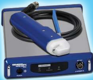
RAPID SEAL II™ SE640 PORTABLE UNIT